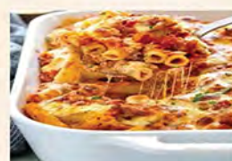
Homemade Baked Ziti