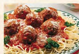
Spaghetti with Meatballs